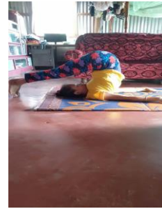
Activity: Celebration of International Yoga Day 2020